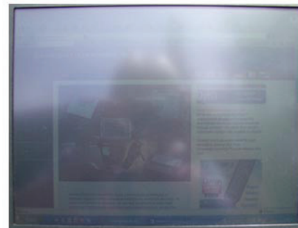
Above: Direct sunlight comparison: DynaVue versus conventional display

ties to virtually eliminate reflection and preserve contrast. That means exceptional viewability in all lighting conditions. Needless to say, that can be a huge selling point. We spent a lot of time analyzing the VR-2's screen outdoors and came away more than impressed. Pen Computing and RuggedPCReview.com's technology editor Geoff Walker wrote a detailed article entitled The Ultimate Outdoor-Readable Touch-Screen Display on the technology at http://www.ruggedpcreview.com/3_technology_itronix_dynavue.html .